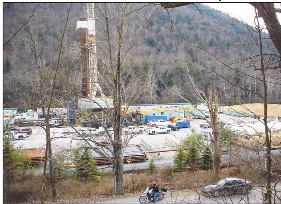
A new well pad sits near a road in Lycoming county. Pads can span from two to fifteen acres each with multiple pads per mile.

While some companies, to come across as good neighbors will negotiate with surface owners about setbacks, well pad placement and site reconstruction, under current law gas